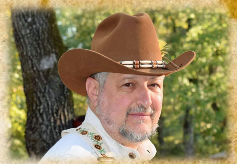
Forest Shadow Range Marshal Oakwood Outlaw #004 SASS # 40625