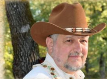
Forest Shadow Range Marshal Oakwood Outlaw #004 SASS # 40625