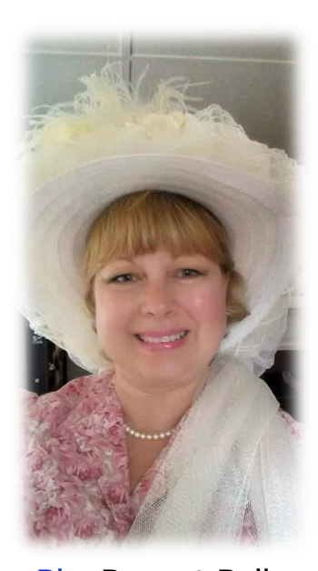
BlueBonnet Belle Web Marshal Photographer Newsletter