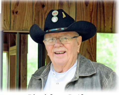
Blackfoot Drifter Monday Range Marshal