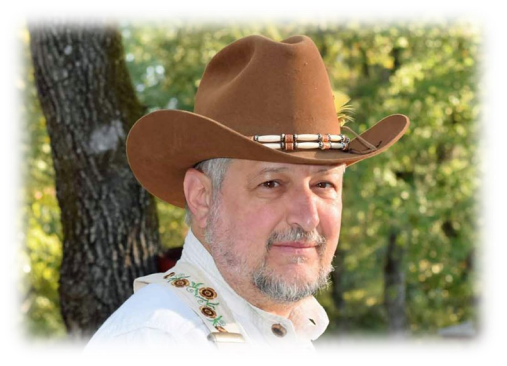
Forest Shadow Range Marshal