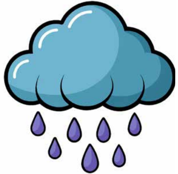
Sunday April 12, 2026 Shoot Canceled due to Rain