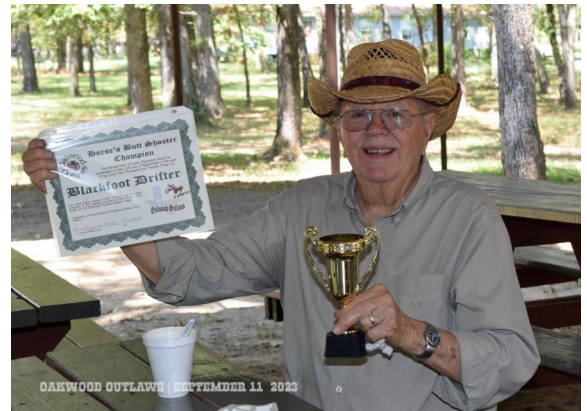
Blackfoot Drifter Horse's Butt Shooter CHAMPION Monday, September 11, 2023

See y'all next month—cooler temps are here! BlueBonnet Belle