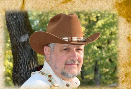
Forest Shadow Range Marshal Oakwood Outlaw #004 SASS # 40625

Hola vaqueros, the Oakwood Outlaws here. September was our Mexican Vaquero shoot and the targets were all dressed up with Mexican flare. We had Mexican themed beads to hand out at sign in and a few shooters were decked out for the Mexican theme.